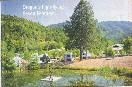
Oregon's high-flying Seven Feathers.